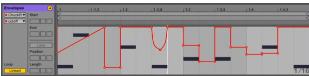
Figure 3. Automation on a 1/16th grid timeline in Ableton Live

This functionality can also be used to modify the program over the duration of an entire composition, making it possible to finally integrate ChucK programs in the context of a through-composed composition, or any other context where written and fixed automation changes are needed. There are many other possibilities as well, e.g. performers using DAWs like Ableton Live and Bitwig can store predefined automation curves in MIDI clips, which they can then use to trigger parameter automation gestures in the ChucK programs on-the-fly when performing live.